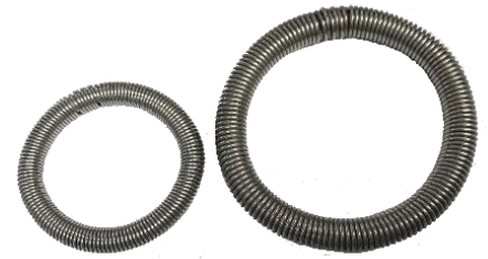
GS Retain Rings