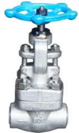
Threaded End SS316 Globe Valves 800 PSI