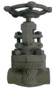
Threaded End Globe Valves A105